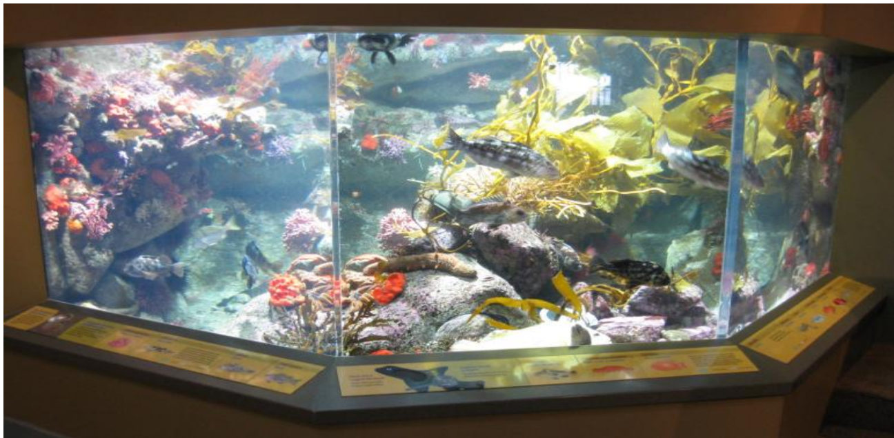
An exhibit at the Monterey Bay Aquarium in Monterey California showcasing the vivid, full spectrum light of Seashine™ fixtures.